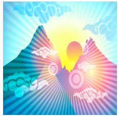
San Jacinto Mts